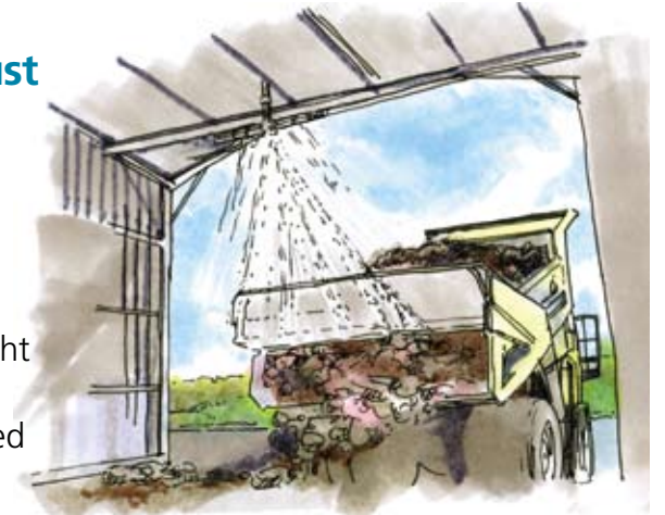
Use water sprays at drop points