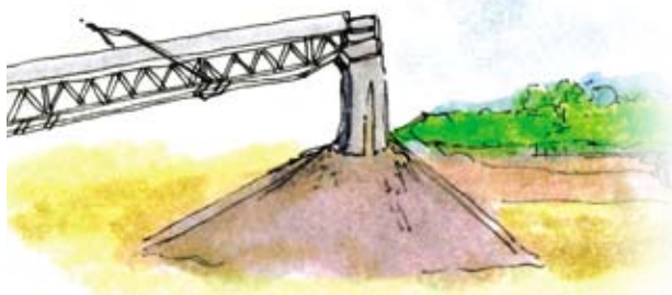
Adjust conveyor height