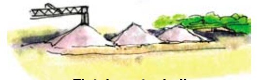
Flat, low stockpiles