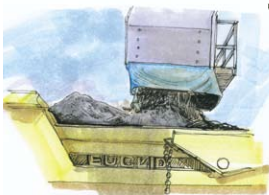
Match load sizes