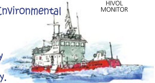
CANADIAN DEPARTMENT OF FISHERIES AND OCEANS

You may notify the Ontario Ministry of the Environment by calling their Spills Action Centre number at 800-268-6060