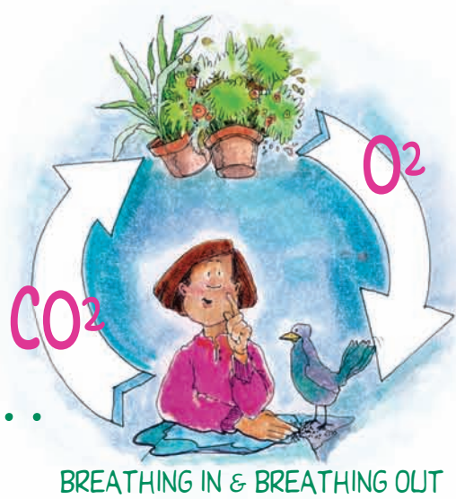
BREATHING IN & BREATHING OUT